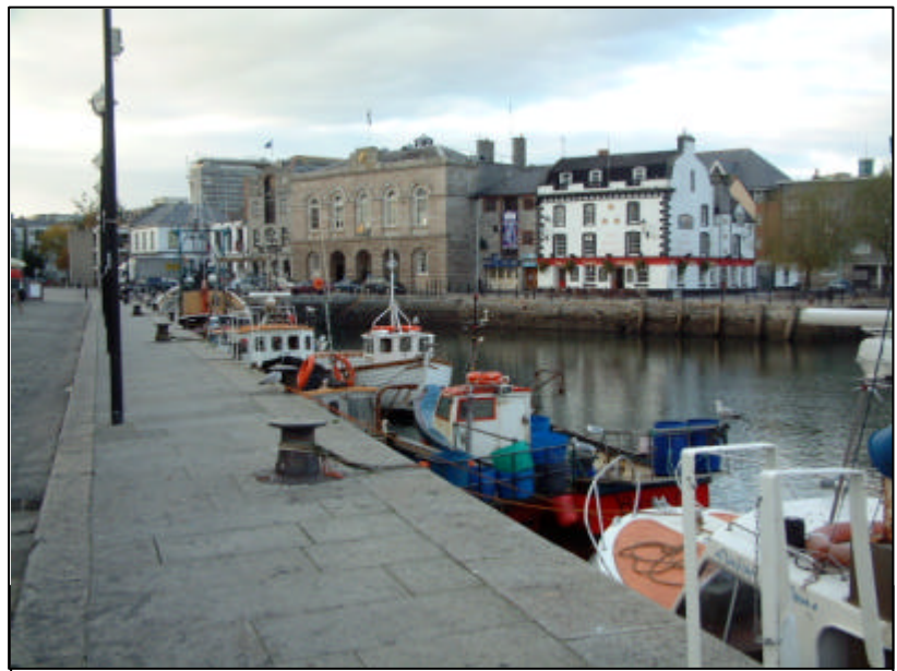
The Barbican is the jewel in the crown of Plymouth as far as visitor economy is concerned